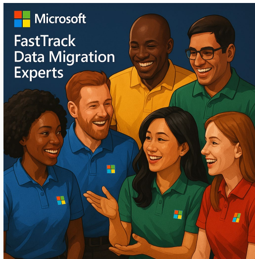
FastTrack Data Migration Experts

Persona: Individuals involved in the work of FastTrack Data Migration using the various technologies and tools necessary to assure a migration engagement is successful.