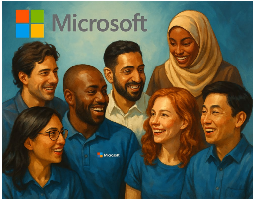
FastTrack Data Migration Technology Specialists

Image above created with Microsoft Copilot